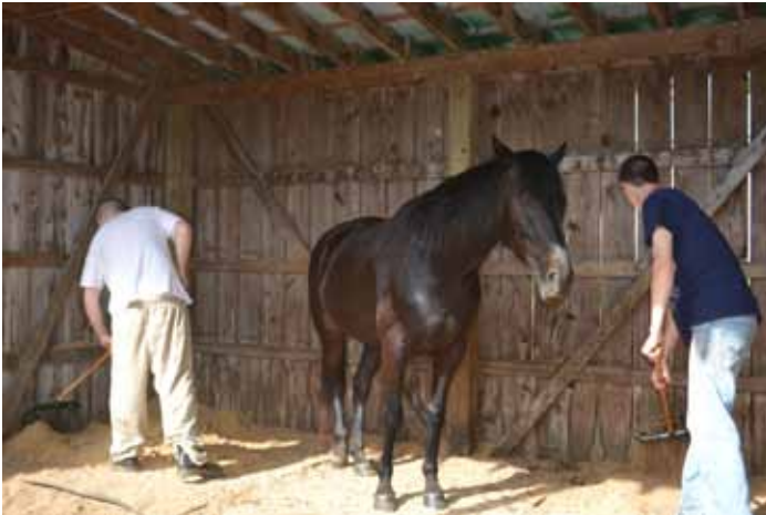
Mountain View students hard at work.